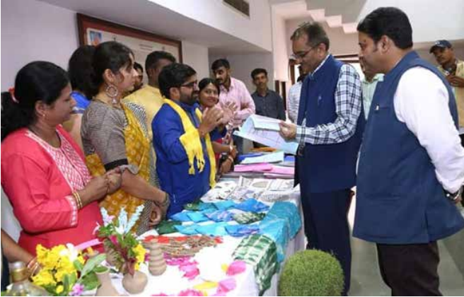
Director, CCRT interacting with teachers at an exhibition on the valediction of the workshop.

A total of 117 teachers from 16 States/UTs namely Andhra Pradesh, Arunachal Pradesh, Assam, Bihar, Chhattisgarh, Delhi, Gujarat, Haryana, Himachal Pradesh, Jammu & Kashmir, Karnataka, Kerala, Maharashtra, Odisha, Telangana and West Bengal participated in the workshop.