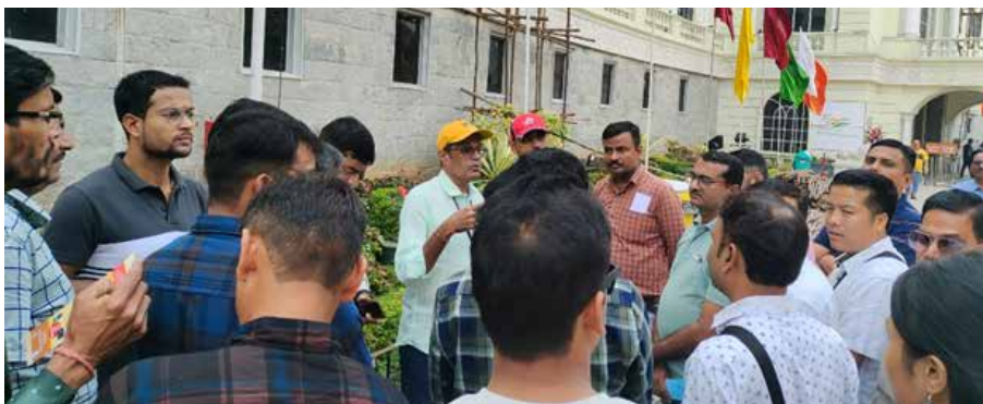
Teacher Participants on educational tour at Salar Jung Museum at Hyderabad

Throughout the workshop, participants actively engaged in a series of interactive sessions, collaborative activities, and in-depth discussions led by esteemed experts in the field. The intensive programme equipped the teachers with innovative strategies and practical insights for integrating Museum resources into their teaching practices, fostering a more immersive and comprehensive educational experience for their students. CCRT's commitment to fostering a Culture of continuous learning and exploration was evident through this empowering initiative, which not only enriched the participating teacher's pedagogical approaches but also emphasized the vital role of Museums in shaping a well-rounded educational landscape.