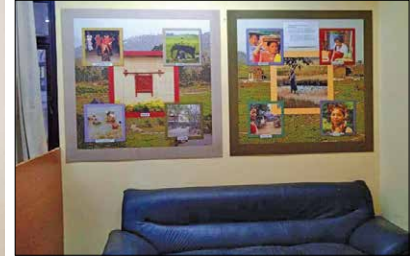
An exhibition of CCRT's Art work at Lalit Kala Akademi