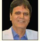
Dr. Vinod Narayan Indurkar Hon'ble Chairman, CCRT

An artistic value is an international language sign unlike the aesthetic value of natural phenomenon; an artistic value is a means of communication, a means of Conveying Value orientations from person to person. To understand an artistic value it is important to treat a work of art as a meta-sign (an indivisible element) of artistic culture.