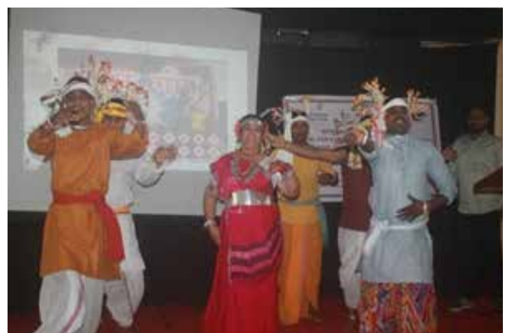
Participants engaging in various cultural activities.