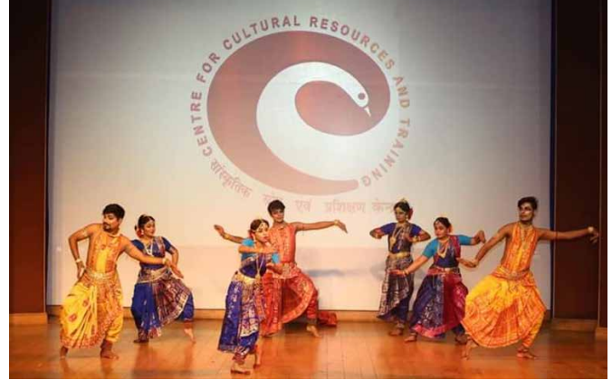
Lecture-demonstration of Gaudiya dance for participants