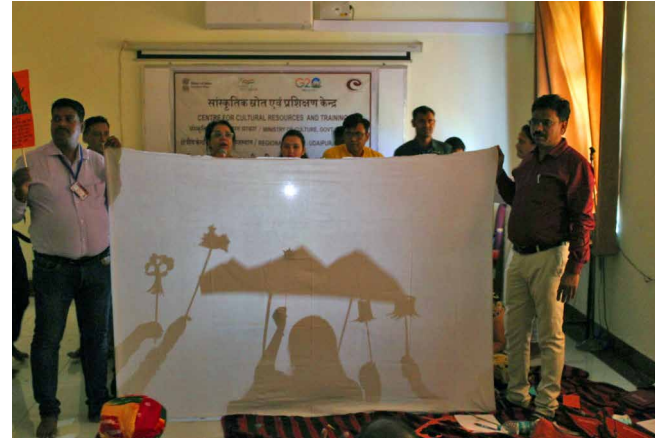
Production of shadow puppet by teacher participants.