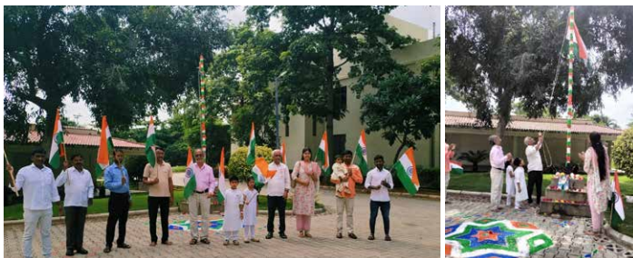
Hoisting National Flag at CCRT, Regional Centre, Hyderabad