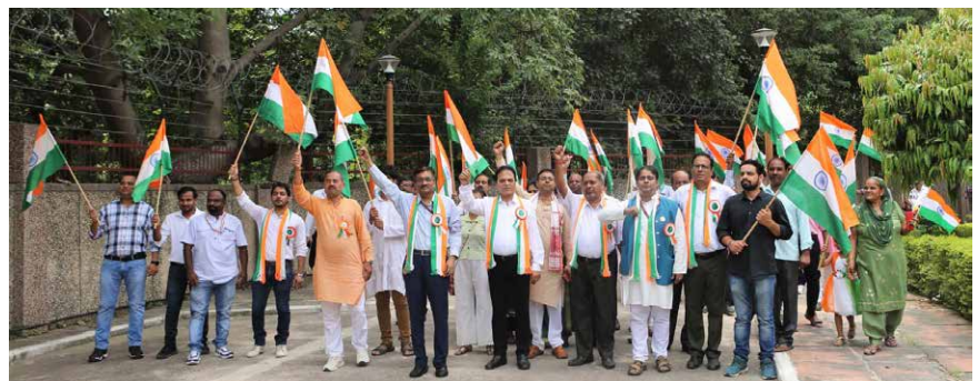
Campaigning for "Har Ghar Tiranga" at CCRT Headquarters, New Delhi