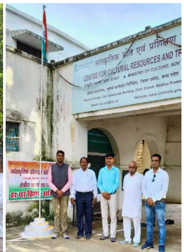
Hoisting National Flag at CCRT, Regional Centre, Damoh