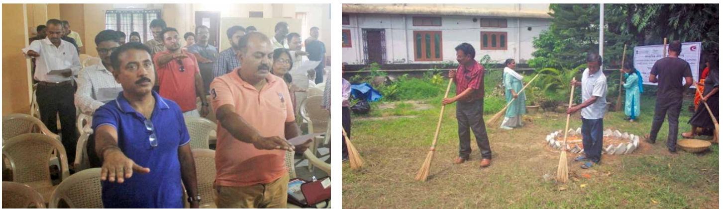
Swachhata Pledge administered among teacher participants and Shramdan activities carried out at Regional Centre, Guwahati.

Lecture Demonstrations on Sustainable Living : Good Practices in Waste Management under Swachh Bharat Mission were delivered under the Orientation Courses at CCRT, New Delhi and CCRT, RC, Guwahati.