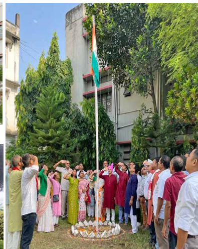
Hoisting National Flag at CCRT, Regional Centre, Guwahati