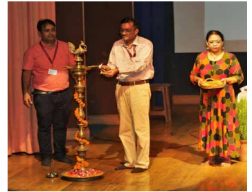
Inaugural function of Orientation Course in line with NEP 2020 for Teacher Educators at CCRT, New Delhi

In an impactful 12-days program held at CCRT Headquarters, New Delhi the Orientation Course for Teacher Educators brilliantly achieved its objectives. The course focused on innovative teaching methodologies to seamlessly integrate cultural elements, aligning with NEP 2020. Participants were facilitated to interact with esteemed scholars, artists, and educationists, instilling a positive approach to innovative teaching. This course empowered the educators to be agents of holistic learning, embracing culture and creativity as core components of education, in harmony with NEP 2020's vision. Participants also visited the Rashtrapati Bhavan Cultural Centre, for the celebrations of International Day of the World's Indigenous People.