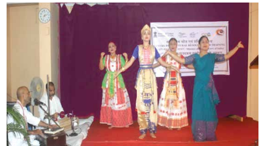
Lecture demonstration on Sattriya Dance under Orientation Course in line with NEP 2020 at CCRT, RC, Guwahati

The captivating Orientation Course aligned with NEP 2020 held at CCRT Regional Centre, Guwahati, from August 03 to 24, 2023, proved to be an exceptional learning experience for the participating teachers. Enriching sessions were accompanied by opportunities for regional cultural exchange, as teachers showcased their native folk songs, dances, and other cultural treasures. Illustrated lectures and demonstrations spanned the realms of Architecture, Literature, Music, Dance, and more, expertly delivered by eminent scholars and artists. Practical workshops in traditional handicrafts, allowed teachers to dive deep into Indian crafts that can be easily integrated into school curriculum. The culmination of the training involved the creation of lesson plans and project works. The Orientation Course thus not only imparted knowledge but also kindled a profound appreciation for India's cultural and artistic wealth among teachers, ensuring its integration into the classroom.