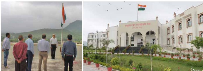
Hoisting National Flag at CCRT, Regional Centre, Udaipur