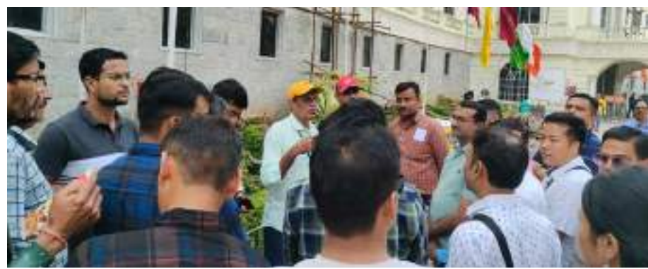
Teacher Participants on educational tour at Salar Jung Museum at Hyderabad

Throughout the workshop, participants actively engaged in a series of interactive sessions, collaborative activities, and in-depth discussions led by esteemed experts in the field. The intensive programme equipped the teachers with innovative strategies and practical insights for integrating Museum resources into their teaching practices, fostering a more immersive and comprehensive educational experience for their students. CCRT's commitment to fostering a Culture of continuous learning and exploration was evident through this empowering initiative, which not only enriched the participating teacher's pedagogical approaches but also emphasized the vital role of Museums in shaping a well-rounded educational landscape.