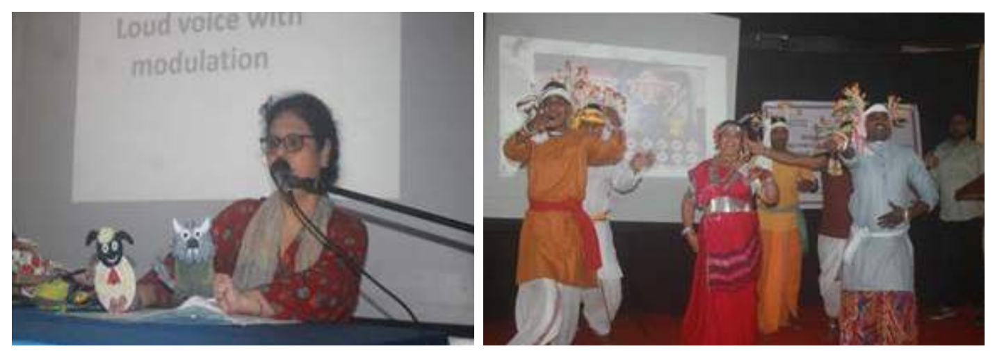
Participants engaging in various cultural activities.

A total of 61 teachers from 10 States/UTs namely Arunachal Pradesh, Bihar, Chandigarh, Chhattisgarh, Haryana, Jammu & Kashmir, Maharashtra, Puducherry, Uttar Pradesh and West Bengal participated in the workshop.