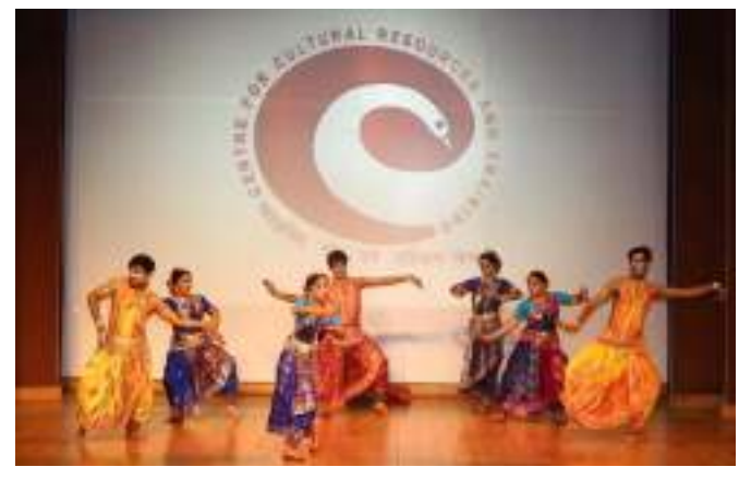
Lecture-demonstration of Gaudiya dance for participants