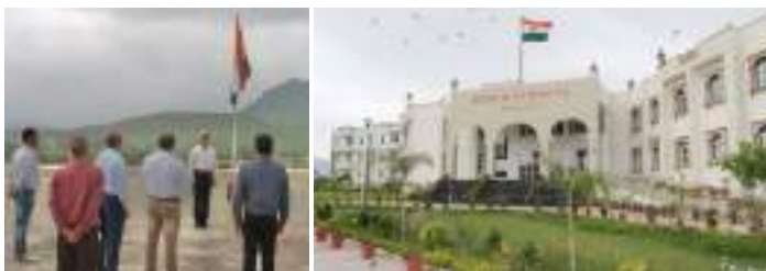
Hoisting National Flag at CCRT, Regional Centre, Udaipur