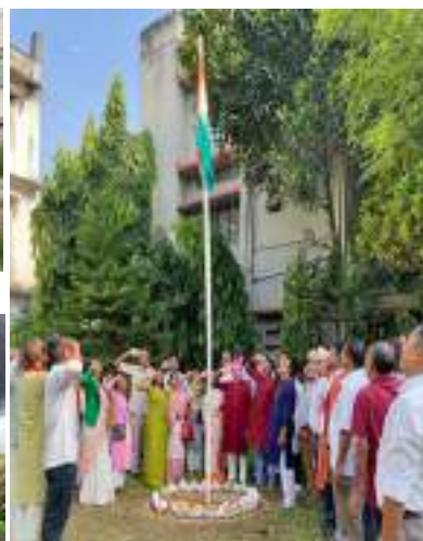
Hoisting National Flag at CCRT, Regional Centre, Guwahati