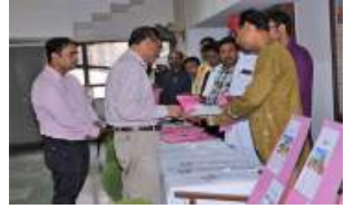
Shri Rishi Vashist, Director, CCRT interacting with participants at an exhibition on occasion of the workshop on 'Role of Museums in School Education'.

The CCRT workshop delved into the vital connection between museums and school education. Participants received invaluable insights into the diverse facets of museums and their integration with classroom teaching, all aligned with the vision of NEP 2020. Participants experienced an enriching visit to the national museum, immersing themselves in India's tangible cultural heritage, and fostering a deep appreciation for art, literature, and heritage. The exploration continued with insightful documentaries on Indus Valley Civilization, followed by guided tours through various galleries of the national museum, enhancing participant's understanding of diverse art forms and their significance. The workshop also included a visit to the National Crafts Museum and Hastkala Academy where they were provided with an overview of India's crafts traditions, emphasizing practical demonstrations and highlighting the cultural significance of weaving techniques.