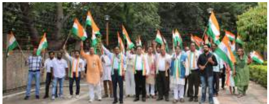
Campaigning for "Har Ghar Tiranga" at CCRT Headquarters, New Delhi