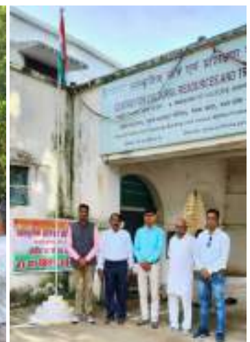
Hoisting National Flag at CCRT, Regional Centre, Damoh