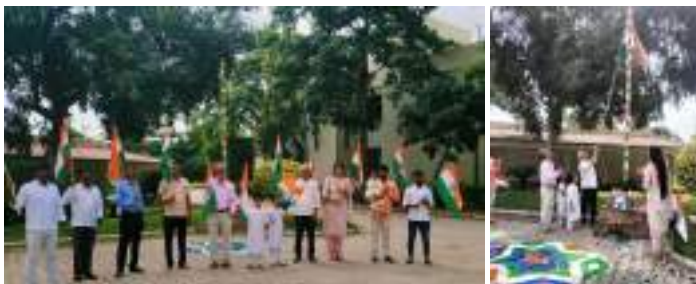
Hoisting National Flag at CCRT, Regional Centre, Hyderabad