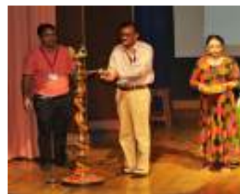
Inaugural function of Orientation Course in line with NEP 2020 for Teacher Educators at CCRT, New Delhi

In an impactful 12-days program held at CCRT Headquarters, New Delhi the Orientation Course for Teacher Educators brilliantly achieved its objectives. The course focused on innovative teaching methodologies to seamlessly integrate cultural elements, aligning with NEP 2020. Participants were facilitated to interact with esteemed scholars, artists, and educationists, instilling a positive approach to innovative teaching. This course empowered the educators to be agents of holistic learning, embracing culture and creativity as core components of education, in harmony with NEP 2020's vision. Participants also visited the Rashtrapati Bhavan Cultural Centre, for the celebrations of International Day of the World's Indigenous People.