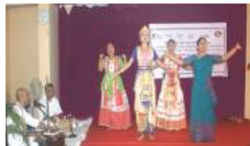
Lecture demonstration on Sattriya Dance under Orientation Course in line with NEP 2020 at CCRT, RC, Guwahati

The captivating Orientation Course aligned with NEP 2020 held at CCRT Regional Centre, Guwahati, from August 03 to 24, 2023, proved to be an exceptional learning experience for the participating teachers. Enriching sessions were accompanied by opportunities for regional cultural exchange, as teachers showcased their native folk songs, dances, and other cultural treasures. Illustrated lectures and demonstrations spanned the realms of Architecture, Literature, Music, Dance, and more, expertly delivered by eminent scholars and artists. Practical workshops in traditional handicrafts, allowed teachers to dive deep into Indian crafts that can be easily integrated into school curriculum. The culmination of the training involved the creation of lesson plans and project works. The Orientation Course thus not only imparted knowledge but also kindled a profound appreciation for India's cultural and artistic wealth among teachers, ensuring its integration into the classroom.