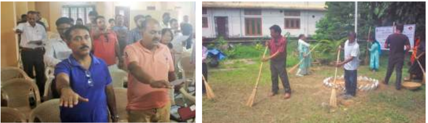
Swachhata Pledge administered among teacher participants and Shramdan activities carried out at Regional Centre, Guwahati.

Lecture Demonstrations on Sustainable Living : Good Practices in Waste Management under Swachh Bharat Mission were delivered under the Orientation Courses at CCRT, New Delhi and CCRT, RC, Guwahati.