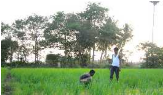
Field visit in Village