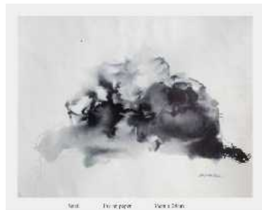
Early Morning in the village