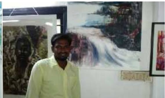
Art show at Kalinga Gallery, Pondicherry