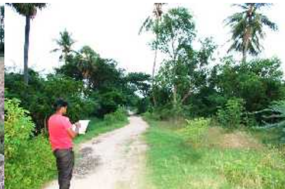
Out Door Drawing