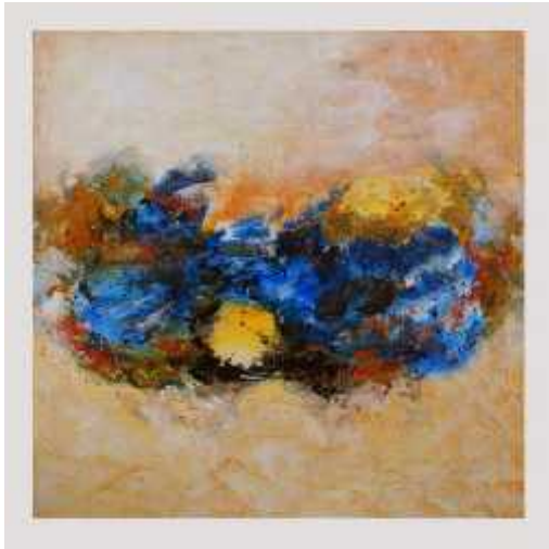
Nature Art work