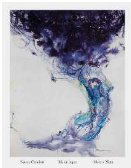
Tree is our Mother