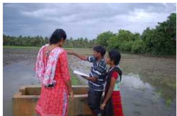
Field Visit- Out door drawing