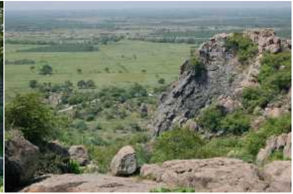
Field Visit at Perumukkal, Tamilnadu