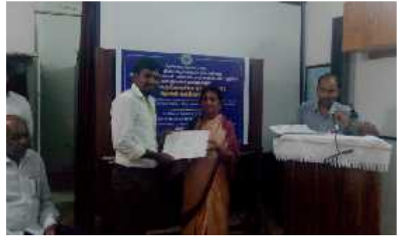
Heritage preservation, National Seminar by Thazhi Foundation, Puducherry