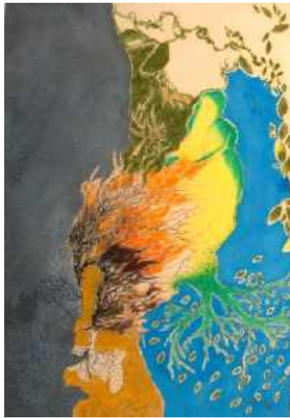
Life of Nature -5