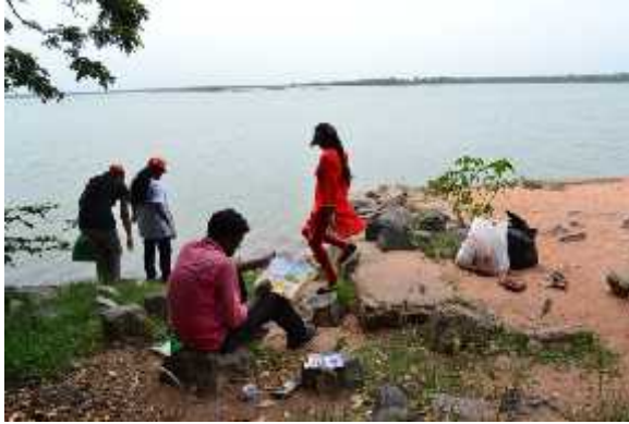
On the spot painting at Ousuterry Lake

community. The beauty of unpolluted Lake Scene had been drawn and documented. I understand that lot of cares must be taken to preserve water resources.