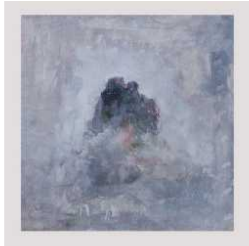
Nature Art work