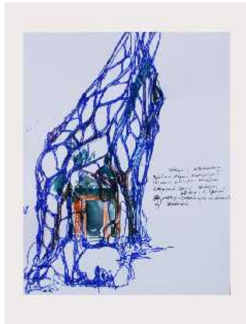
Life of Nature -6