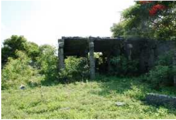
Field Visit at Perumukkal, Tamilnadu