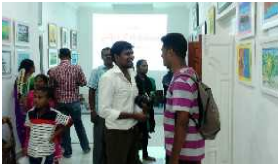
Art show at 'I' Art Research Foundation