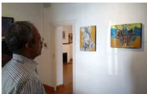
Art show at Thapong Visual Art Centre, Gaborone, Botswana