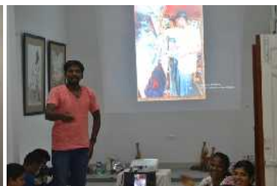
Delivering Activities at I Art Studio