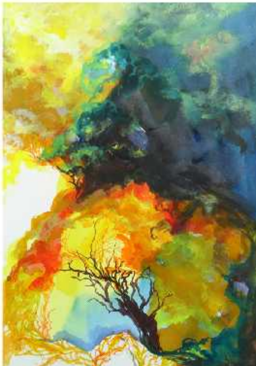
Title: The Life of Nature 3