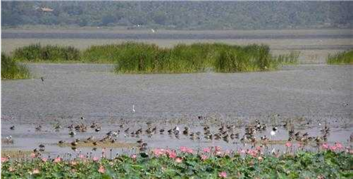
Ousteri Lake, Pondicherry

There are several river in Pondicherry. Gingee River, Guduvaiyar River, Malattar River, Pambaiyar River and Pennaiyar River are effectively crosses in Pondicherry region. Now most of the rivers does not have water due to lack of rain, drought. It happens not only because of lake of rain fall but also human's unawareness about the nature. People are living with sophisticated life which is against nature. Village is turning to empty land. No agricultural farming. Very limited farmers are ploughing and seeding their land form crop. There is no hard work. Everybody wants white color job. They come out from the village and settling urban side. These kinds of lifestyle spoil human kind and nature as well.