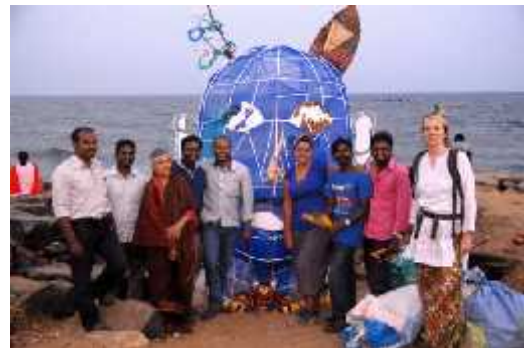
Coastal Environmental awareness Art work