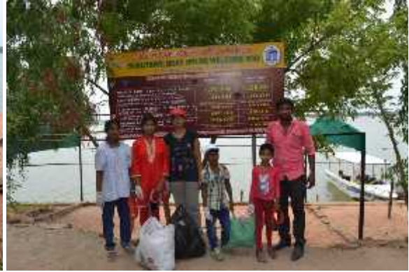
Save Nature for Safe Future team, Ousutery