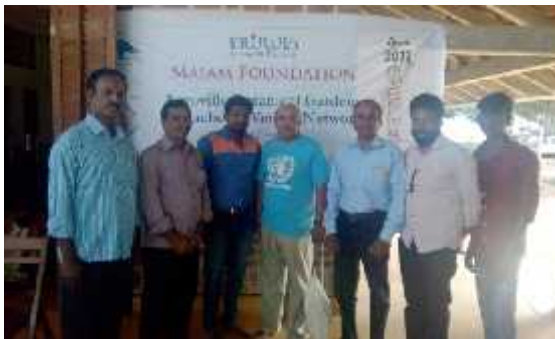
Maiyam Foundation, National Environmental Seminar