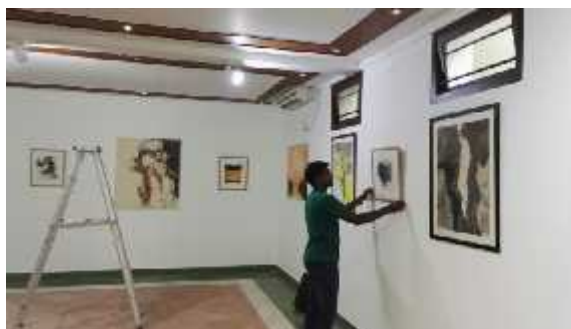
In Delhi Art show- LKA, Jan 20018