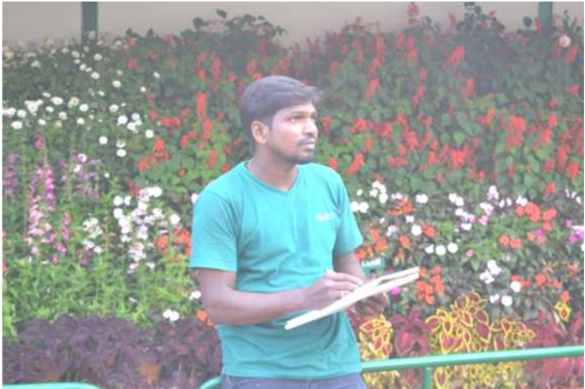
Outdoor art sketch at Ooty hill, 2016,

happy. I made several art sketches in that place. Ooty 6 is one of beautiful hill station for tourists.