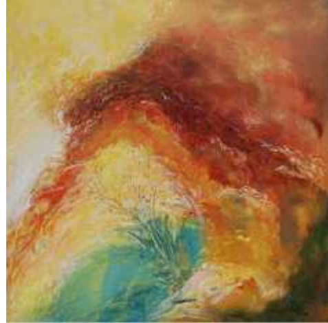
Title: The Life of Nature 2