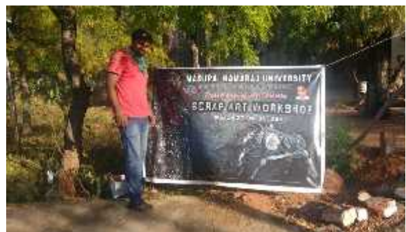
Scrap Art Workshop at Madurai Kamararj University