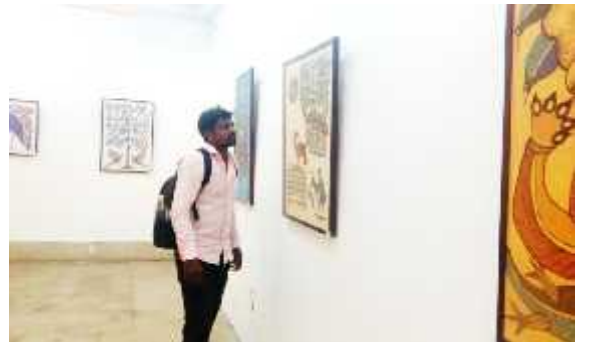
Art Exhibition Visit