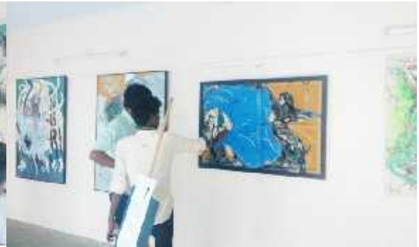
Art Exhibition in Puducherry