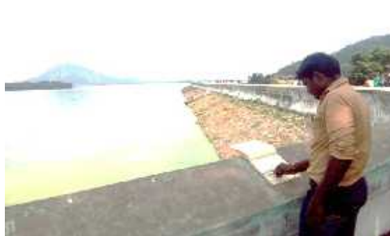
Out door Drawing- Dam