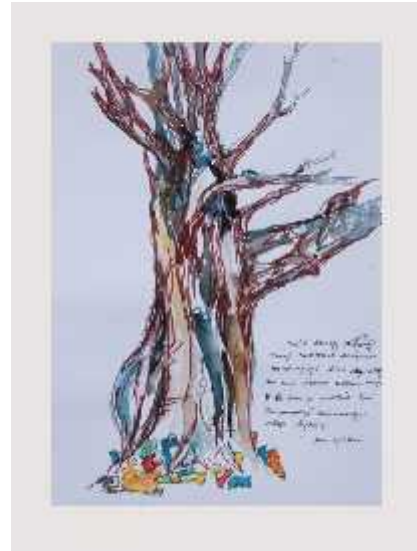
Study of Branch