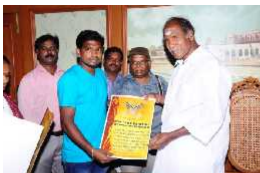
Appreciation from Ex. Chief Minister of Puducherry