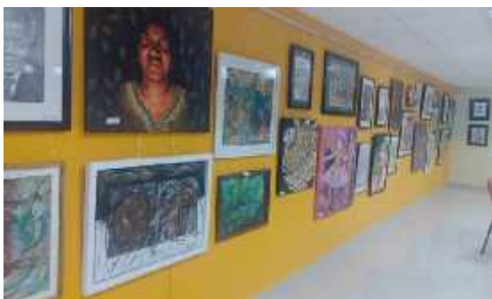
Art show at Jipmer, Pondicherry