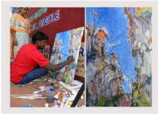
Work at stage