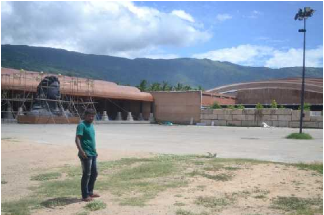
At Velliangiri Mountain, Tamilnadu. June 5 th 2016

I made several drawings in that Othyampattu village. After the Othyapattu village visit, when I returned to home I came across the concrete building city where there were no birds and green fields. It was a contradictory environment. I realized that villages are the heaven. Villages are the precious place for wealth nation; it is the place which provides healthier society. As our father of our nation Mahatma Gandhi says “India lives in villages and agriculture is the soul of Indian economy”. Nearly two thirds of its population depends directly on agriculture for its livelihood. Agriculture is the main stay of India’s economy. It is our duty to save our land.