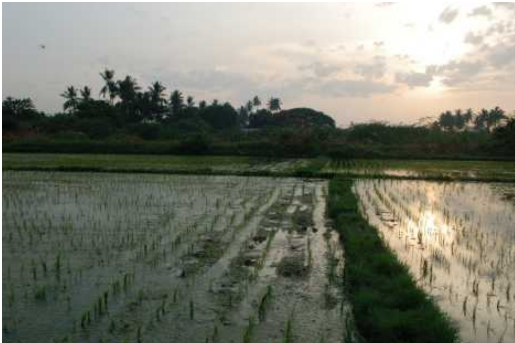
Farmers field Arumbarthapuram Village, 2016

Human brain developed the society system at the same time it destroyed Nature. It is very essential to tune our life style towards healthy life without disturbing nature.