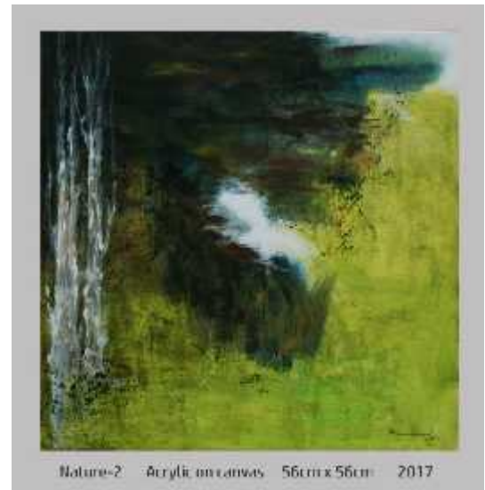
Nature Art work