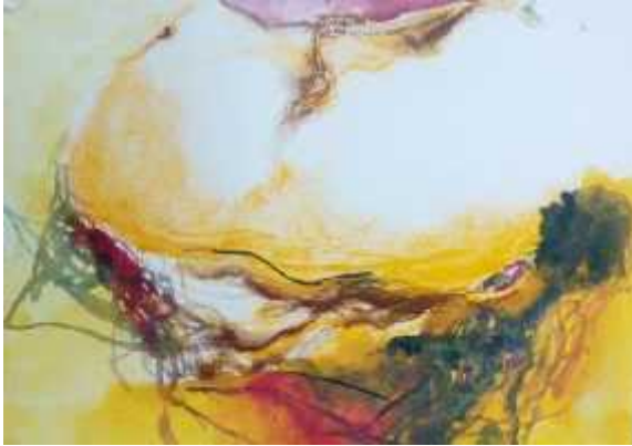
Title: The Life of Nature 1