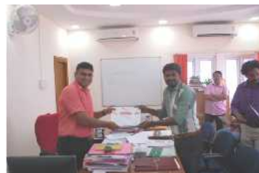
Appreciation from Art and Culture Secretary, Puducherry