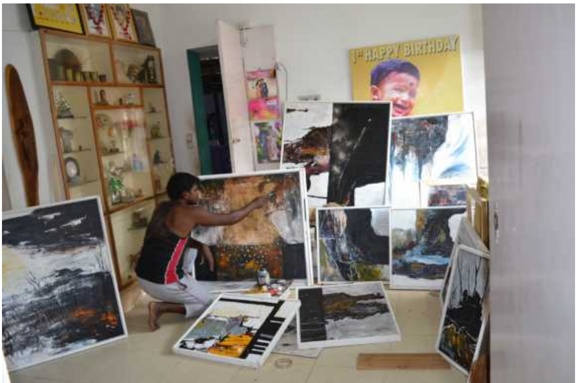
Work at Researchers Studio