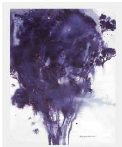
Branches in the morning