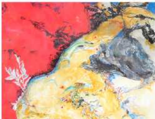
Nature Art work