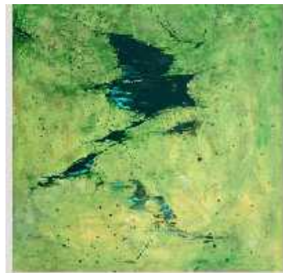
Nature Art work