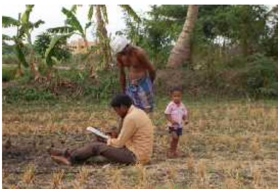
Field Visit- Out door drawing