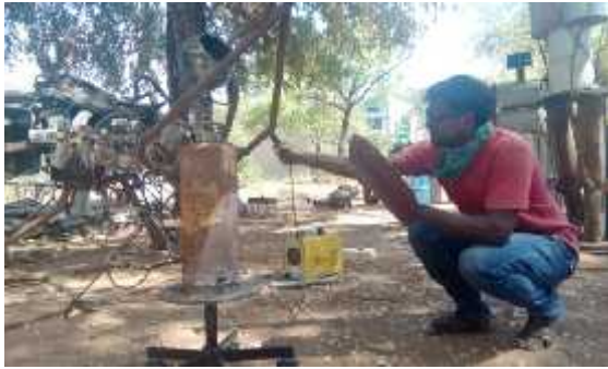
Scrap Art Workshop at Madurai Kamaraj University