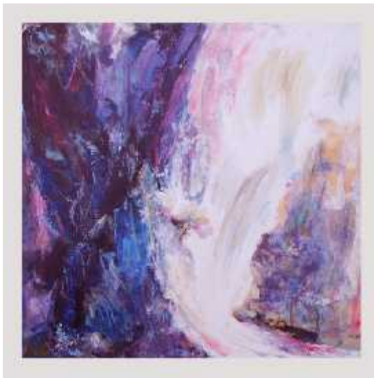
Nature Art work